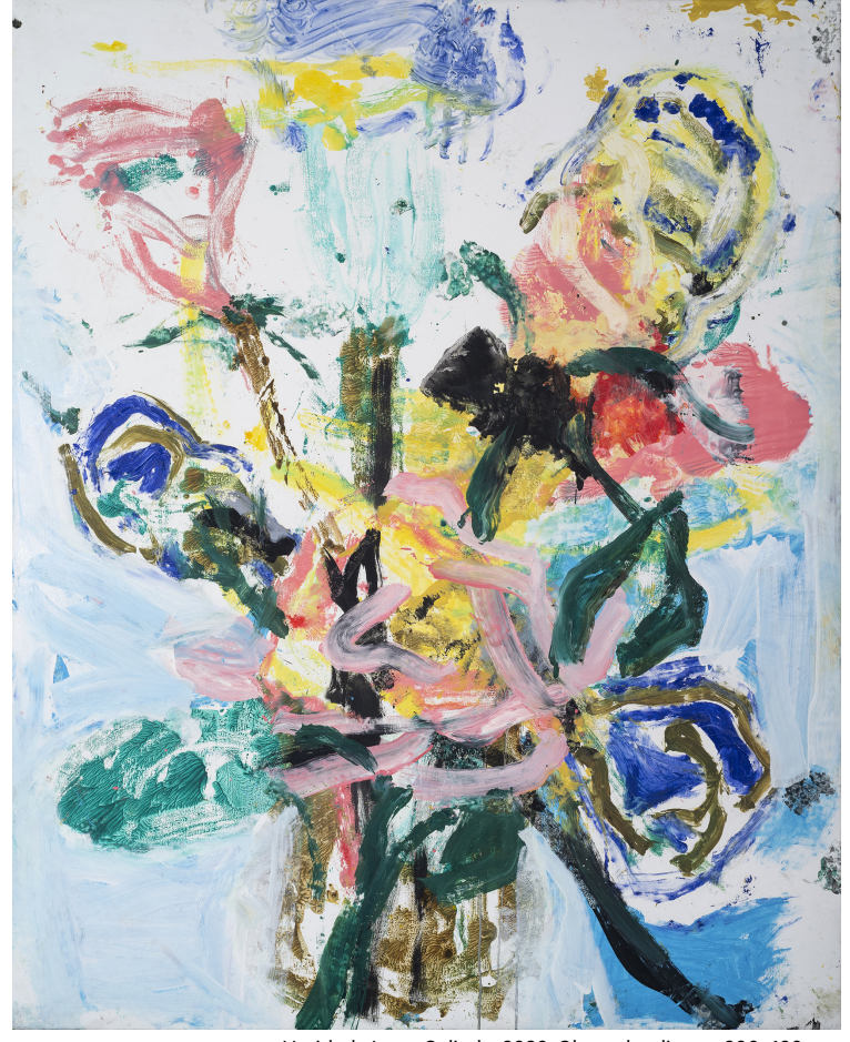
Untitled, Jorge Galindo, 2020, Oleo sobre lienzo, 200x160 cm