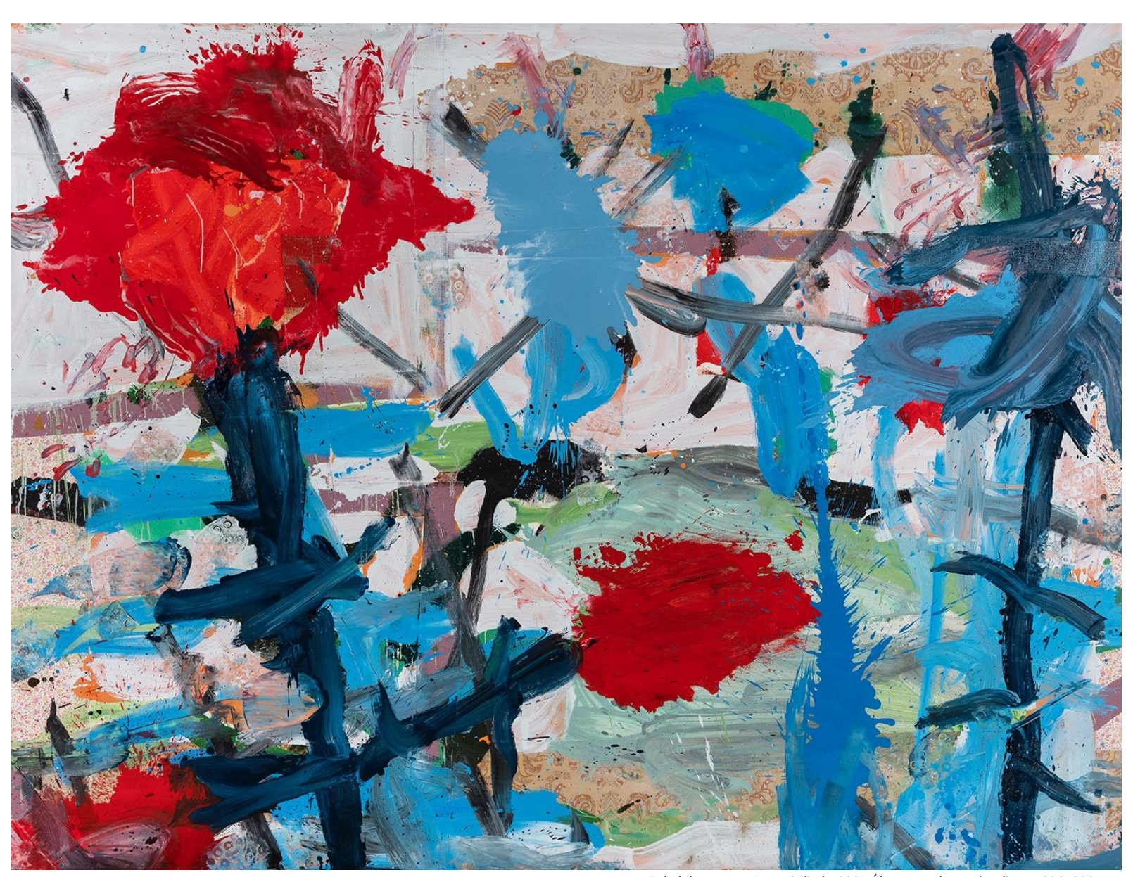
Babel de estraza, Jorge Galindo, 2021, Óleo y papel pegado a lienzo, 200x300 cm