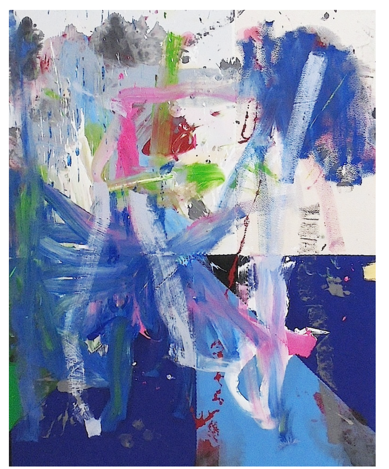
Fosa de los kuriles, Jorge Galindo, 2018, Mixta sobre collage de telas, 200x160 cm

- Choque, Museo de Bellas Artes de Santander, Santander, Spain