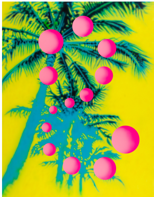
Reality is the new spam 31, 2023, 210x165 cm