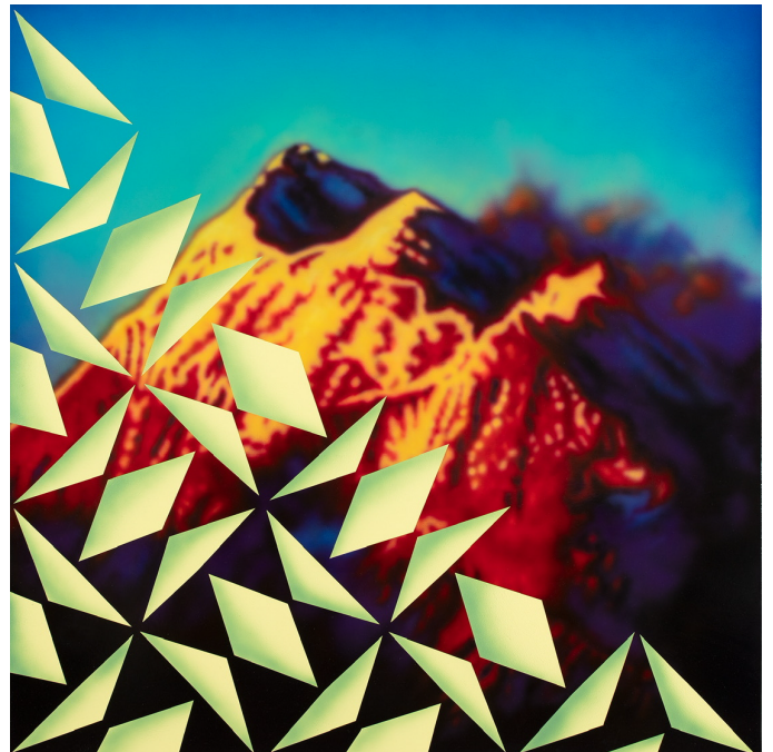
Reality is the new spam 24, 140x140 cm