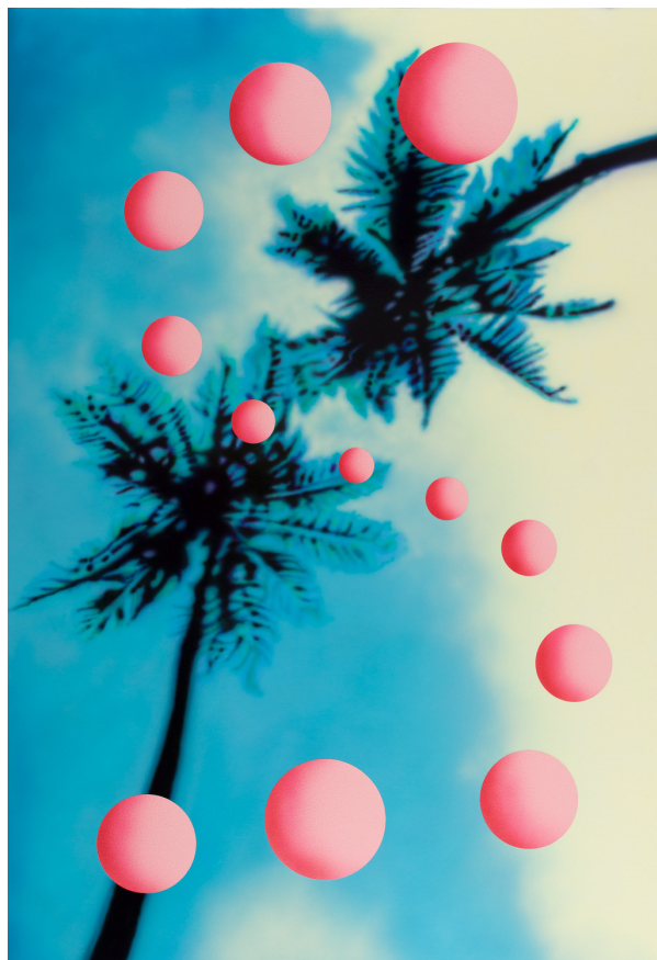
Reality is the new spam 30, 2023, 200x138 cm